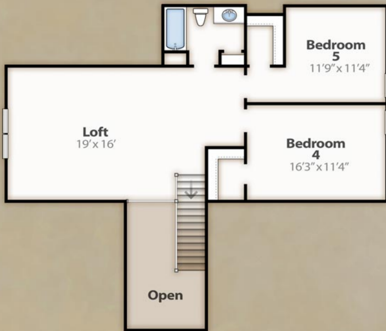
Optional Second Floor

Stair location for optional second floor